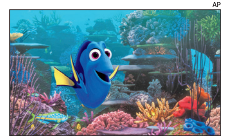
DORY FOUND: For the first time, researchers have successfully bred Pacific blue tangs in captivity. The blue species is the model for the forgetful fish in the films 'Finding Nemo' and 'Finding Dory